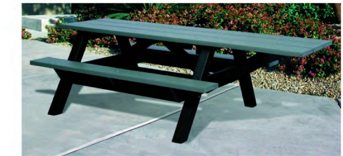
ADA Accessible Picnic Sites